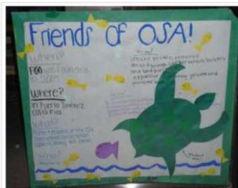
Students want their donation to support Friends of the Osa's Sea Turtle Conservation Program

her eggs that will ensure the survival of this ancient species.