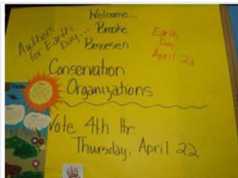
Vote for your favorite conservation organization